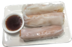
炸兩 Chinese Donut Rice Noodle Rolls (Served Until 3 PM) $8.55