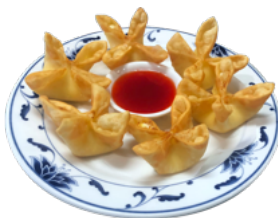
炸蟹角 Crab Rangoon Puffs $8.25 (6 Pcs)