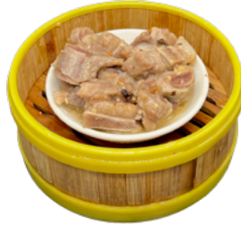
豉汁蒸排骨 Spare Ribs in Black Bean Sauce $7.55