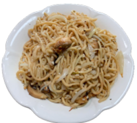
大蒜麵 Garlic Noodles $19.95