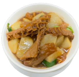
蘿蔔炆牛雜 Bovine Offal with Daikon $15.95