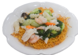
港式海鮮煎麵 Hong Kong Style Seafood Fried Noodles $24.95