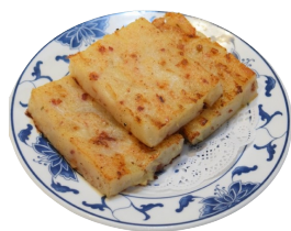
香煎蘿蔔糕 Pan Fried Daikon Cakes $6.95 (3 Pcs)