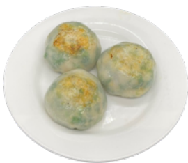
香煎菲菜粿 Pan Fried Shrimp and Chives Dumplings $8.55 (3 Pcs)