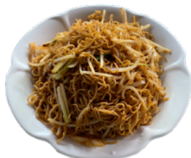
豉油皇炒麵 (主菜) Supreme Soy Sauce Chow Mein (Entrée Size) $18.95