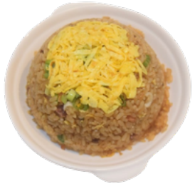
生炒糯米飯 Stir Fried sticky Rice $11.75