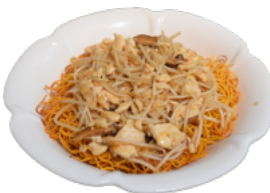
港式煎麵 (菜, 雞, 牛, 猪, 或叉燒) Hong Kong Style Fried Noodles (Vegetable, Chicken, Beef, Pork, or BBQ Pork) $20.95