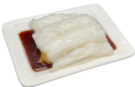
齋腸粉 Plain Rice Noodle Rolls (Served Until 3 PM) $7.25