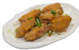
椒鹽雞翼 Salt and Pepper Chicken Wings $16.55