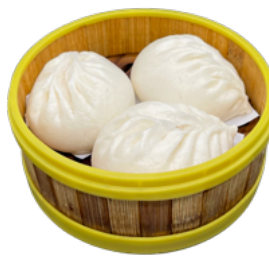
美味雞包 Steamed Chicken Buns $6.95 (3 Pcs)