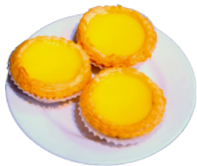
酥皮蛋撻 Baked Egg Tarts (Served Until 3 PM) $6.95