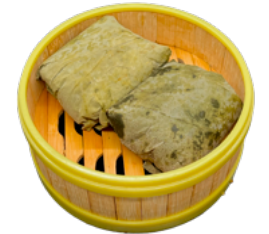
珍珠糯米雞 Sticky Rice Lotus Leaf Wraps $7.95 (2 Pcs)