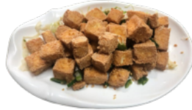
椒鹽豆腐 Salt and Pepper Crispy Tofu $12.95