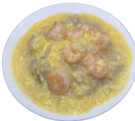
滑蛋虾仁河粉 Shrimp Chow Fun with Egg Gravy $23.95