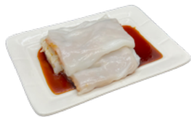
牛肉腸粉 Beef Rice Noodle Rolls (Served Until 3 PM) $8.55