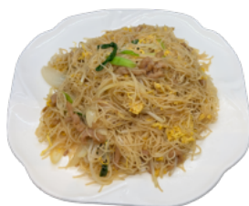
炒米粉 (雞或猪) Vermicelli Noodles (Chicken or Pork) $20.95