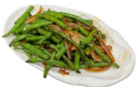
乾扁四季豆 (點心) Sautéed String Beans (Dim Sum Size) $12.95