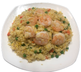
蝦仁炒飯 Shrimp Fried Rice $20.95