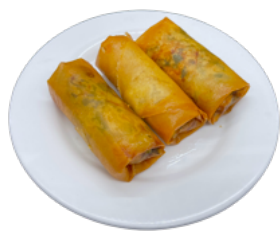
鮮蝦炸春卷 Crispy Shrimp Egg Rolls $9.25 (3 Pcs)