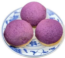
焗紫薯包 Baked Ube Buns $7.95