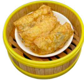
鮑汁鮮竹卷 Bean Curd Rolls $7.55 (3 Pcs)