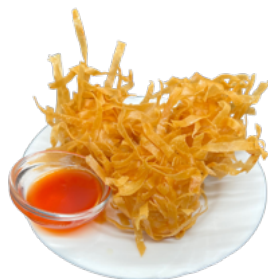
百花炸蝦丸 Crispy Shrimp Meatballs $9.25 (3 Pcs)