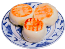
特色生煎包 Pan Fried Pork Buns $7.25 (3 Pcs)