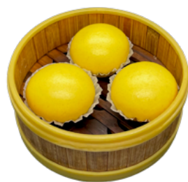
甘筍流沙包 Steamed Custard Lava Buns $8.25 (3 Pcs)