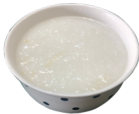
明火白粥 Plain Congee $7.25