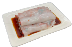
叉燒腸粉 BBQ Pork Rice Noodle Rolls (Served Until 3 PM) $8.55