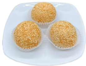
芝麻煎堆球 Fried Sesame Balls $6.95