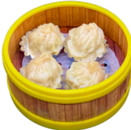
上海小籠包 Shanghai Pork Soup Dumplings $8.25 (4 Pcs)