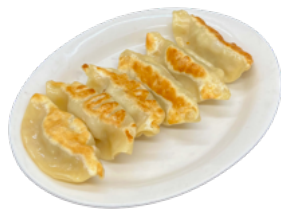
香煎鍋貼 Pot Stickers $9.25 (6 Pcs)