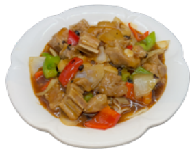
豉椒排骨河粉 Spare Ribs Chow Fun in Black Bean Sauce $23.55