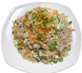
瑤柱蛋白炒飯 Dried Scallop Egg White Fried Rice $22.95