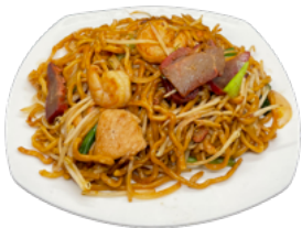
雜錦炒麵 House Deluxe Chow Mein $22.95