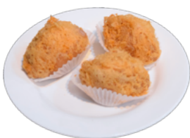
蜂巢芋角 Fried Taro Pork Dumplings (Served Until 3 PM) $7.25