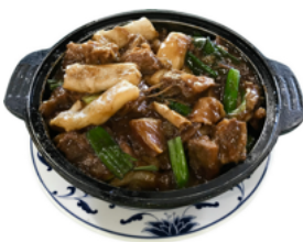
牛腩腸粉煲 Clay Pot Beef Stew Rice Noodle Rolls $17.95