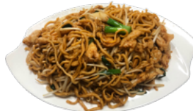
炒麵 (菜, 雞, 牛, 猪, 或叉燒) Chow Mein (Vegetable, Chicken, Beef, Pork, or BBQ Pork) $19.95