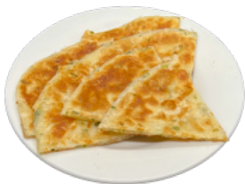
香煎蔥油餅 Flaky Scallion Pancakes $6.25 (3 Pcs)