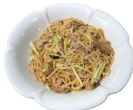
蟹肉韭王伊麵 Crab Meat E-Fu Noodles $26.25