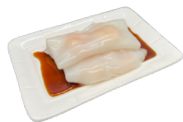
鮮蝦腸粉 Shrimp Rice Noodle Rolls (Served Until 3 PM) $9.25