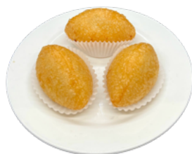
家鄉鹹水角 Fried Glutinous "Football" Dumplings $6.95 (3 Pcs)