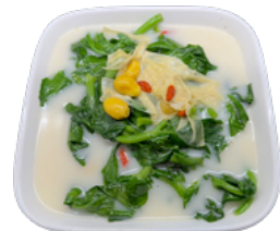
銀杏枝竹浸 (波菜或 豆苗) Ginkgo, Yuba, and (Spinach or Pea Shoots) in Broth $14.50 or $16.50