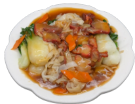
濕炒河粉 (菜, 雞, 牛, 猪, 或叉燒) Gravy Chow Fun (Vegetable, Chicken, Beef, Pork, or BBQ Pork) $22.55