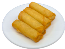
齋春卷 Vegetarian Egg Rolls $6.55 (4 Pcs)