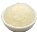
絲苗白飯(碗) Jasmine Rice (Per Bowl) $2.75