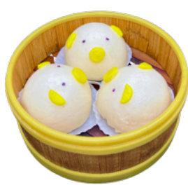
奶黃豬仔包 Piggy Egg Custard Buns $8.75 (3 Pcs)