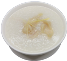
生滾魚片粥 Fish Fillet Congee $14.55