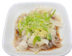
白灼牛百葉 Poached Beef Tripe $14.75