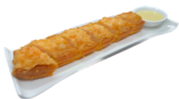
蝦多士 Shrimp Toast $13.95