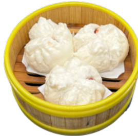
蠔皇叉燒包 Steamed BBQ Pork Buns $6.95 (3 Pcs)