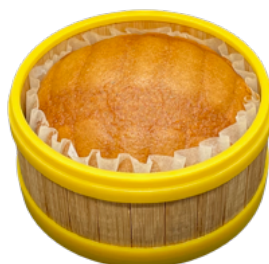
古法馬拉糕 Steamed Sponge Cake $6.95