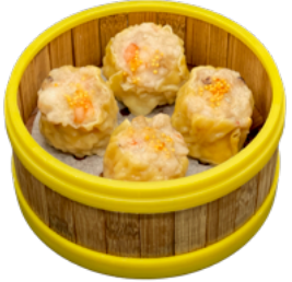
香菇燒賣皇或黑松露燒賣皇 Jumbo Siu Mai or Truffle Siu Mai $8.55 or $12.25 (4 Pcs)