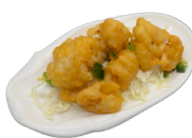
椒鹽魷魚 Salt and Pepper Calamari $14.75