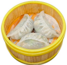
豆苗雜菌素餃 Pea Shoot Mushroom Dumplings $8.25 (3 Pcs)