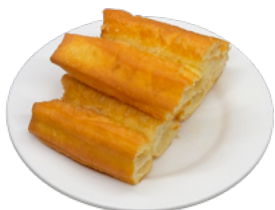
黃金油條 Deep Fried Chinese Donuts $5.95