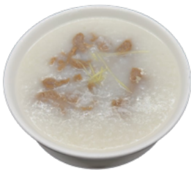
生滾牛肉粥 Beef Congee $13.55