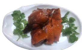
美味燒鴨 (點心) Roast Duck (Dim Sum Size, Quarter Duck) $14.75