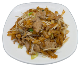
乾炒河粉 (菜, 雞, 牛, 猪, 或叉燒) Stir Fried Chow Fun (Vegetable, Chicken, Beef, Pork, or BBQ Pork) $21.50