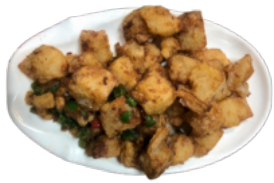
XO 醬炒蘿蔔糕 XO Sauce Pan Fried Daikon Cakes $13.55