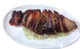
美味叉燒 BBQ Pork Slices $13.55