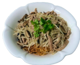
芽菜肉絲煎面 Shredded Pork Bean Sprouts Fried Noodles $21.95