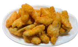
金沙南瓜 Fried Kabocha Squash with Salted Egg Yolk $12.95