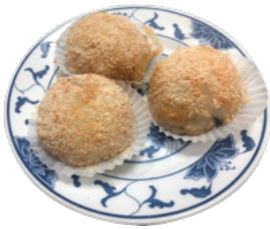
擂沙湯圓 Chinese Sesame Soft Balls $7.95