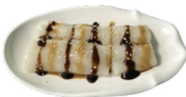
混醬腸粉 Mixed Sauce Rice Noodle Rolls (Served Until 3 PM) $7.55