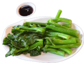
蠔油芥蘭 (點心) Chinese Broccoli with Oyster Sauce (Dim Sum Size) $12.95