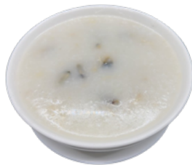
皮蛋瘦肉粥 Pork and Preserved Egg Congee $13.55