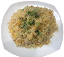
鹹魚雞粒炒飯 Salted Fish and Chicken Fried Rice $22.95