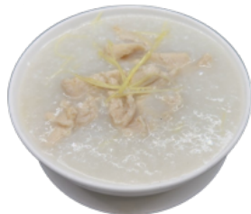
生滾滑雞粥 Chicken Congee $13.55