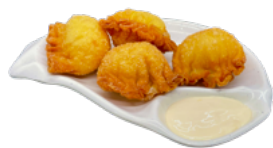
酥炸明蝦角 Deep Fried Shrimp Dumplings $9.25 (4 Pcs)