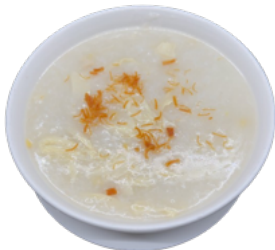
瑤柱腐竹白果粥 Dried Scallop, Ginkgo, and Yuba Congee $14.95