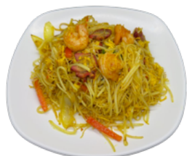
星州炒米粉 Singapore Style Curry Vermicelli Noodles $21.95