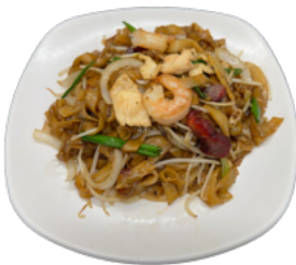
雜錦炒粉 House Deluxe Chow Fun $23.95