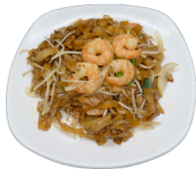
虾仁河粉 Shrimp Chow Fun $22.95