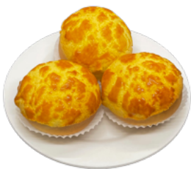
菠蘿奶黃包 Crispy Custard Buns $7.95 (3 Pcs)