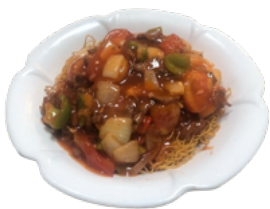
番茄牛煎麵 Tomato and Beef Fried Noodles $23.95