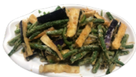
椒鹽豆角茄子 Salt and Pepper String Beans and Eggplants $12.95