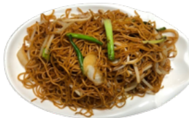
豉油皇炒麵 (點心) Supreme Soy Sauce Chow Mein (Dim Sum Size) $12.95