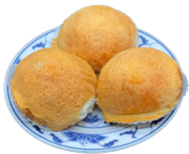
焗叉燒包 Baked BBQ Pork Buns (Served Until 3 PM) $6.95 (3 Pcs)