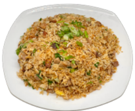
炒飯 (菜, 雞, 牛, 猪, 或叉燒) Fried Rice (Vegetable, Chicken, Beef, Pork, or BBQ Pork) $19.95