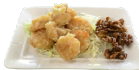
合桃明蝦 (點心) Honey Glazed Walnut Shrimp (Dim Sum Size) $16.75