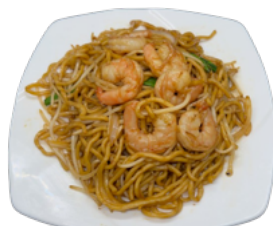
蝦仁炒麵 Shrimp Chow Mein $20.95