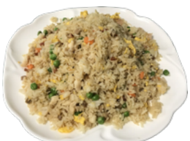
雜錦炒飯 House Deluxe Fried Rice $21.95